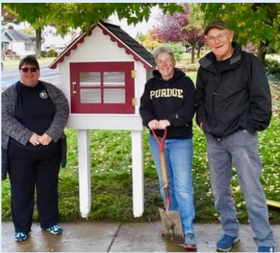
Stocking our food pantry

Sunday morning worship inspires us to serve our neighbors as we are sent out from Eucharist "to love and serve the Lord!" Outreach is at the very heart of who we are. One longtime congregant called St. Andrew's "a service church."