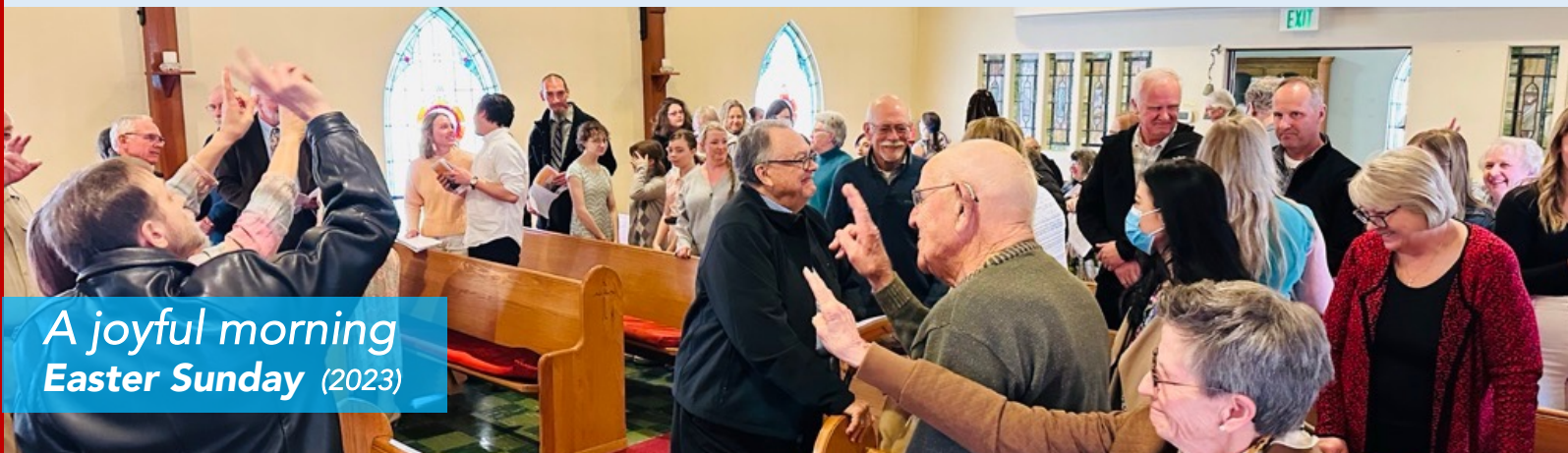
A joyful morning Easter Sunday (2023)

being the church. This means we stand ready partner alongside a new cleric in co-leading ministry. In 2023, our Bishop's Committee led a five-week Lenten Series on the Theology of Liturgy , with wide participation. The sessions led to rich discussions on the meaning of worship, and a deeper understanding of our active role as the baptized assembly of God's people. We seek a part-time Vicar whose primary role is presiding at Eucharist on Sundays, preaching whenever possible, and partnering with us to ensure our worship and outreach remain vital and living expressions of our awe of God. Our Eucharistic Ministers, Eucharistic Visitors, volunteer administrator, and licensed lay Preacher are great resources for partnership with our new cleric.