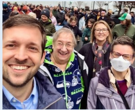
Marching on MLK Day